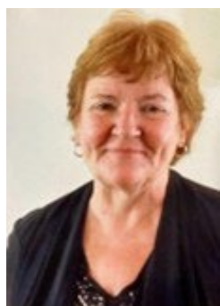
Mayor Heather McKenna

North Rustico Sewer & Water Corporation are looking to go paperless. Paperless billing provides instant notification when your bill is ready, including the amount due and the dates- all in your email. Sign up by calling the Town Office at (902)963-3211 or stopping into the office.