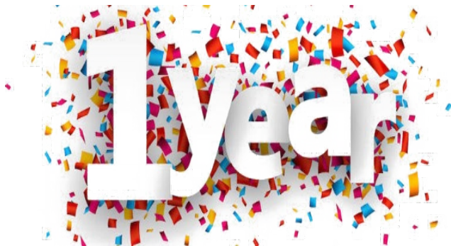
February 16 th marks the 1 Year Anniversary

This February be careful not to get a fright when you look for your shadow on Feb 2 Groundhog Day! February is the shortest month in the calendar year, but this year is a leap year so Happy Birthday on Feb 29 to all those who only get a birthday every 4 years! It is also known for being the month of love with Valentine's Day on the 14 th . February 16 th marks the 1-year anniversary of the opening of the Eliyahu Wellness Centre Canada Games Place!! Islander Day is February 19 so I would like to wish all Islanders a Happy Islander Day and hope everyone gets to enjoy some time with family and friends.